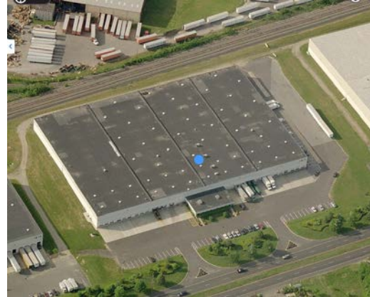
Site Images prior to new roof installation